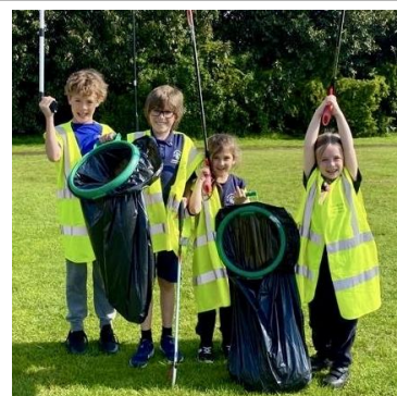
West Kidlington School litter picking