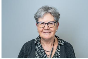
Alison Street – Orchard 07527 278758