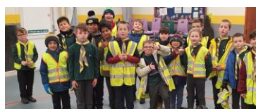
Thanks to Jacala Cub Pack