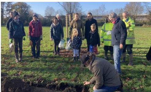
Lyne Road Community Day

We initiated a policy of 'No-Mow May' to set aside some green areas on Parish Council land in Lyne Road Green, Foxdown Close and north of Chorefields, in order to let seeds flower prior to a flower survey of existing species in June '21 by Thames Valley Environmental Records Centre. The results were published in October and all species can be viewed on the Parish Council website. The photographic evidence and identification in the Greenspace Survey Report informs us where and how to enhance through a planting plan for 2022-23. The detail and colours captured justify our decision to leave some areas wild, to provide habitat connectivity, although the range and abundance of species needs ongoing attention. We aim to create a wild flower meadow in Lyne Road Green and all will be welcome to join in with this project.