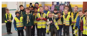
Thanks to Jacala Cub Pack